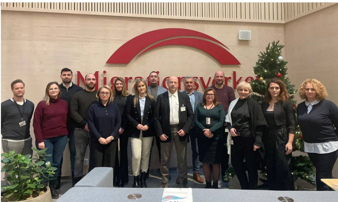
Activity Spotlight – Swedish Migration Agency in Stockholm, 13 December 2024

Seventeen participants, including representatives from WB beneficiary institutions, associated project partners – representatives from Federal Ministry of Interior of Austria and Ministry of Migration and Asylum of Greece, and members of the SMA Academy, attended the visit.