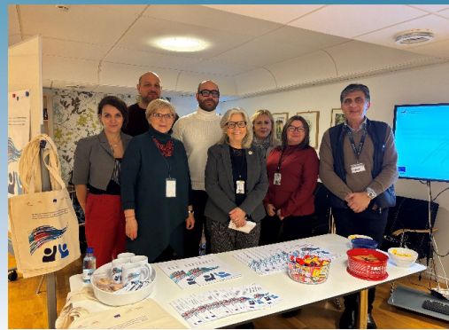
Norrköping, Sweden, 10 December 2024

On the following day, a Project Coordination Team meeting was held with the participation of project partners and beneficiary institutions. During the meeting, participants reviewed the project's progress and planned future activities and coordination efforts. They discussed 16 priority training topics for the development of training programs aimed at beneficiary institutions in the Western Balkans, considering plans for their implementation. The team also explored the most effective modalities for these training programs to ensure they would be beneficial for the entire Western Balkans region.