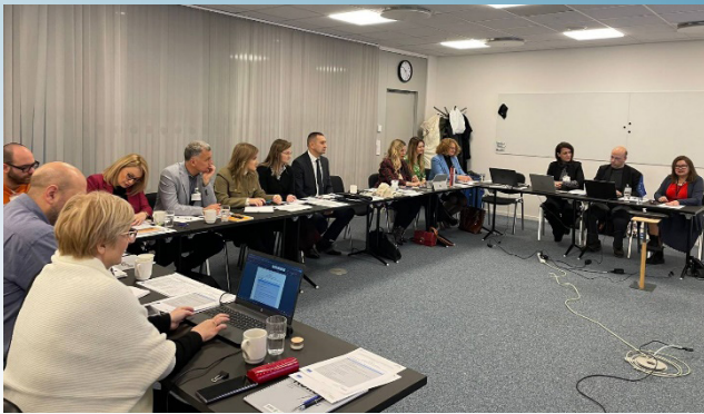
Project Coordination Team meeting, 11 December 2024