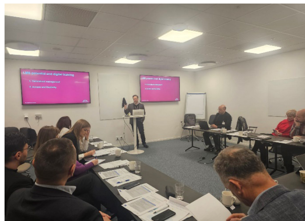
Swedish Migration Academy in Stockholm, 12 December 2024

The study visit proved highly beneficial, with participants expressing satisfaction over the knowledge exchange and practical insights gained. They appreciated the detailed presentations and the opportunity to engage directly with SMA experts on topics ranging from Swedish migration policy to the development of digital training tools. The discussions laid a solid foundation for future collaboration, particularly in designing training curricula and developing digital training solutions for the Western Balkans.