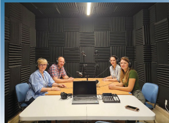
RMTc, Plandiste, Serbia, June 2025

This upgrade marks a strategic step in transforming the Centre into a regional hub for innovation, training, and collaboration in migration management.