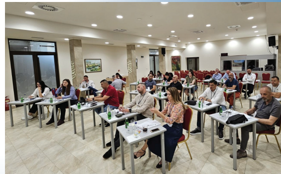
RMTc, Plandiste, Serbia, 10 June 2025.