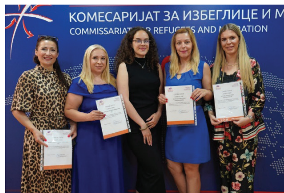
SCRM, Belgrade, Serbia, June 2025

The delivery of English classes in Ministries of Interior in Montenegro and North Macedonia is still ongoing in both countries. The remaining modules will be delivered following the summer break, with the full completion of the course expected in the upcoming months, starting from August and September.