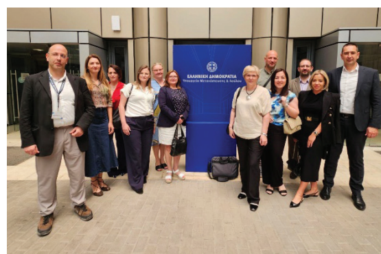
MoMA, Athens, Greece, 5 June 2025

Discussions also introduced the MIRCO 2 concept, with beneficiary institutions expressing interest in continued collaboration, enhanced training formats, and new research initiatives. The next coordination meeting is scheduled for September 2025 in Skopje.