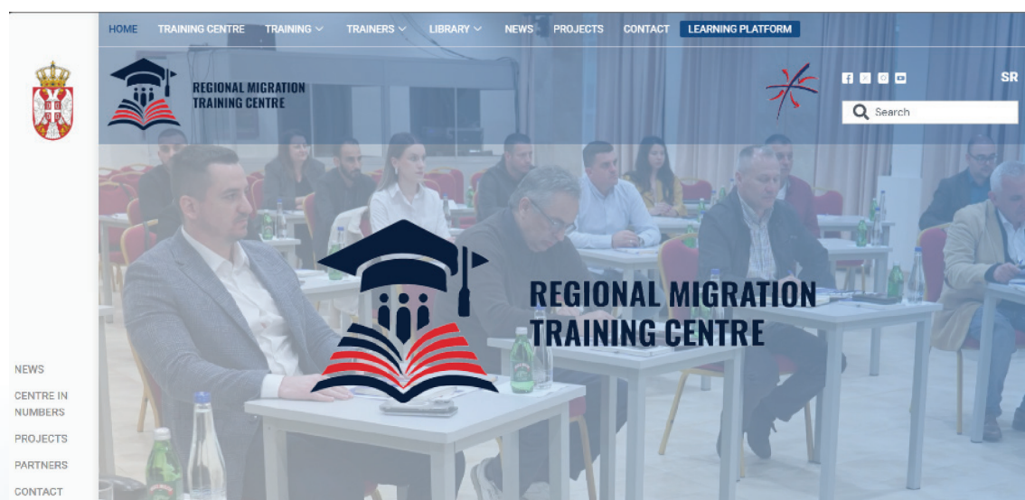
Regional Migration Training Centre, website home page

We are excited to announce that the RMTc website and its dedicated eLearning platform are now fully developed and operational! This digital hub includes a comprehensive e-library that is freely accessible to all partner institutions across the Western Balkans, as well as other stakeholders involved in migration management in the region.