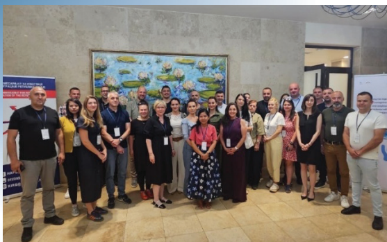
RMTc, Plandiste, Serbia, 12 June 2025

The Training of Trainers session marked a significant milestone in building a skilled regional network of migration professionals equipped to deliver high-quality training sessions. With more training modules underway the MIRCO project continues to foster long-term capacity-building across the region. The successful collaboration between institutions and international experts further highlights the commitment to harmonizing migration management with EU standards and promoting sustainable regional cooperation.