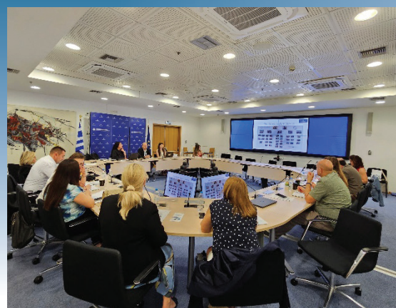
MoMA, Athens, Greece, 4 June 2025

rection for the ongoing implementation of the MIRCO project and the development of coordinated migration training efforts across the Western Balkans.