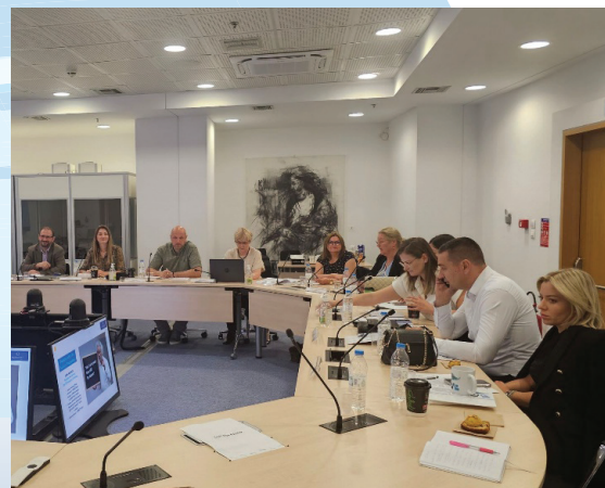
MoMA, Athens, Greece, 3 June 2025

The hosts offered valuable insights into MoMA's operations, with a particular emphasis on training programmes available in Greece, curriculum development, and their capacity-building efforts. The exchange of knowledge and experiences significantly contributed to the ongoing implementation of the MIRCO project.