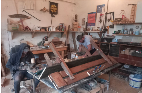
| CA Obrenovac, carpentry workshop