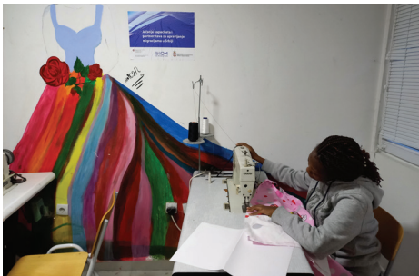
| CA Krnjaca, tailoring workshop