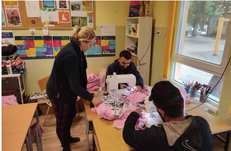
| RC Sombor, tailoring workshop