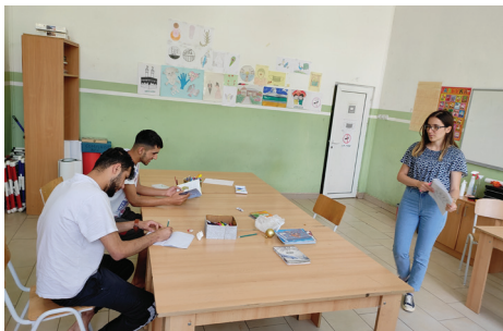
| CA Sjenica (Serbian and English language lessons)