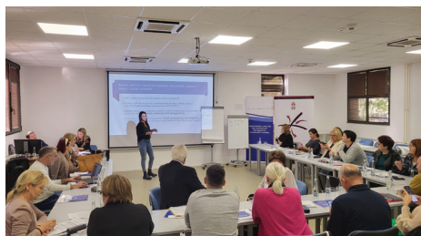
Training in the field of migration management at the Migration Training Center in Plandište