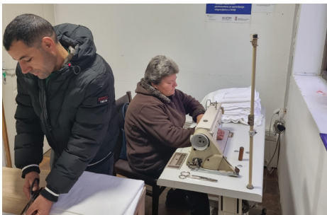
| RC Presevo, tailoring workshop