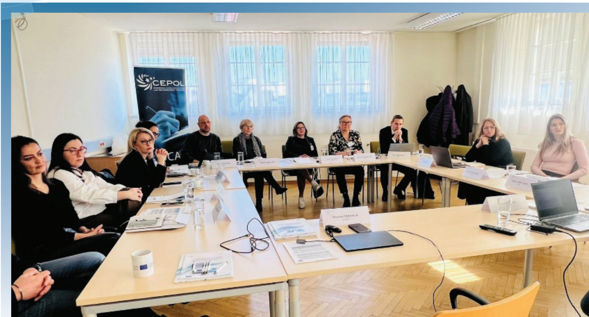
SIAK, Vienna, Austria, 18 March 2025

The primary objective of the visit was to familiarize Western Balkans migration institutions with European Union training strategies and best practices related to institutional capacity building, career development tools, and approaches to reducing staff turnover. The study visit provided in-depth insights into Austria's innovative training systems, with a particular emphasis on migration management and law enforcement.