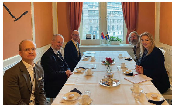
Swedish Ministry of Justice, Stockholm, Sweden 25 March 2025.