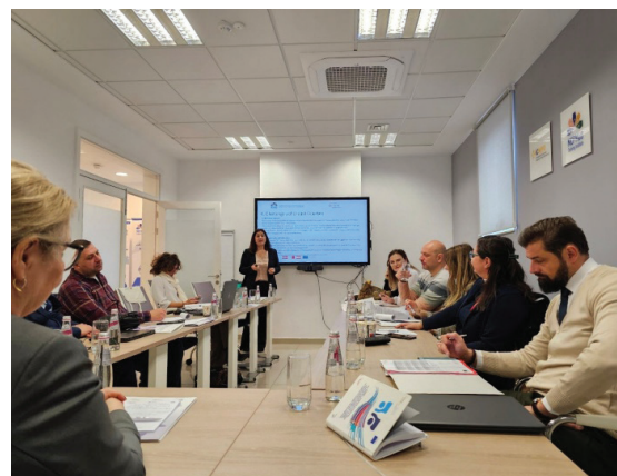
TI Malta, Valletta, 4 March 2025

This visit significantly contributed to the MIRCO project's objectives by providing practical guidance on leveraging MCP MED TI Malta's expertise for the development of the Western Balkans Regional Migration Training Center in Plandiste, Serbia. The two-day visit laid a solid foundation for continued collaboration and future knowledge-sharing with MCP MED TI Malta.