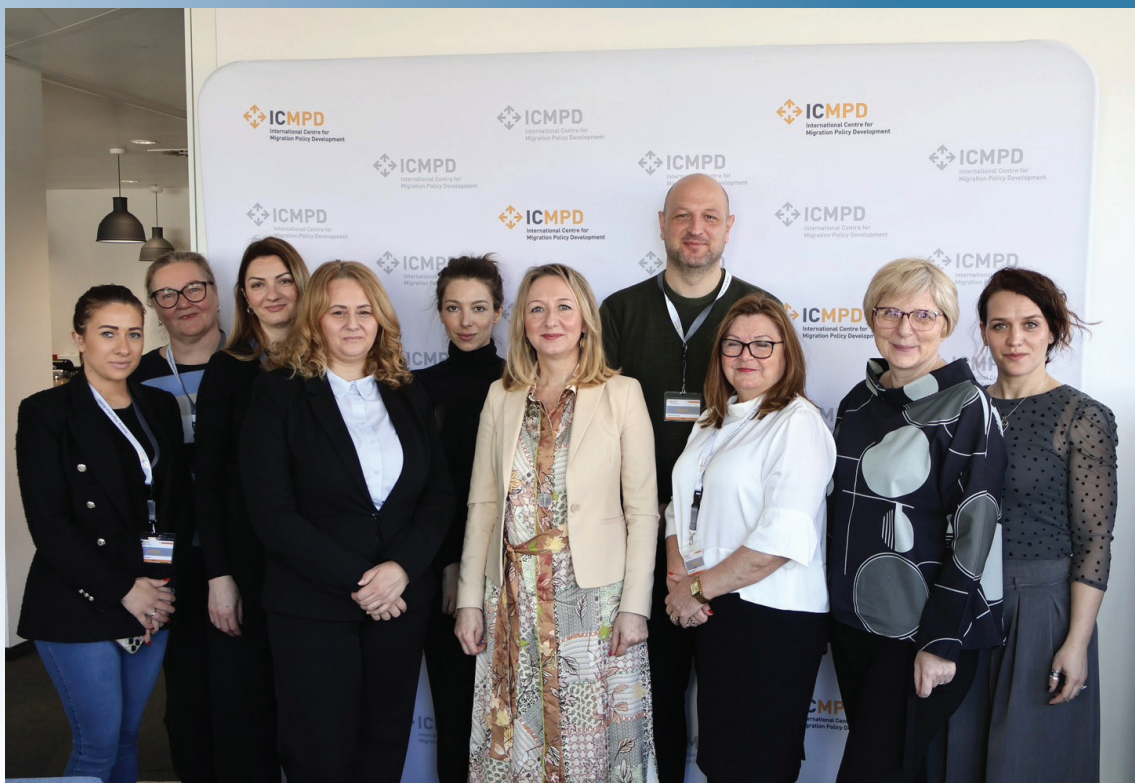
ICMPD office, Vienna, Austria, 21 March 2025