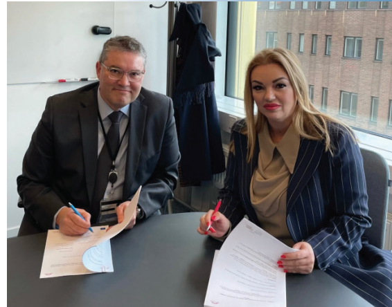
Swedish Migration Agency, Stockholm, Sweden, 26 March 2025

Discussions also focused on upcoming steps, such as accreditation of the training centre, digitalization of training content, training of trainers, and further study visits. During her official visit, Commissioner Stanisavljević also met with Sweden's State Secretary at the Ministry of Justice, Andreas Hall, to discuss the current migration situation in Serbia.