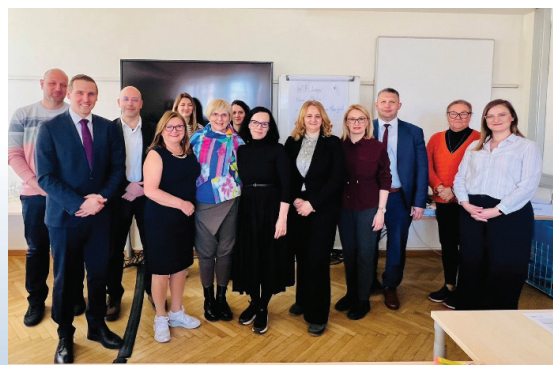
SIAC, Vienna, Austria, 20 March 2025

plan for the implementation of project activities for the period April–June 2025, while discussing priorities and institutional capacities needed for effective execution.