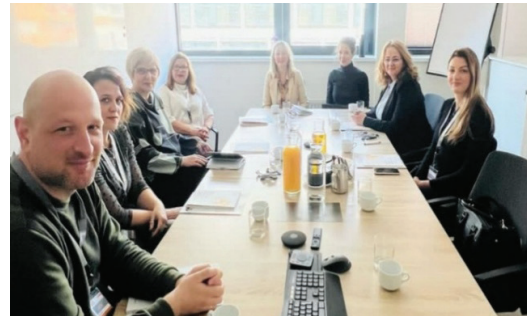
ICMPD office, Vienna, Austria, 21 March 2025

The main theme of the meeting was fostering cooperation between the organizations to enhance the impact of future initiatives. This productive exchange marks an important step toward strengthening partnerships and ensuring synergies in upcoming projects.