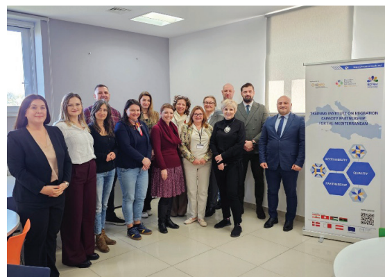
TI Malta, Valletta, 5 March 2025